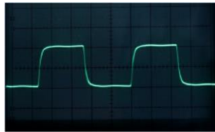
Fig.3 Square Wave 20KHz

Measured by LEADER LAG-126 Audio Signal Generator and KENWOOD CS-4125 Oscilloscope.